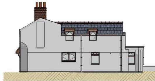
3 Side Elevation 1:100