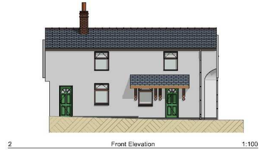
2 Front Elevation 1:100

This drawing is to be read in conjunction with the written specifications provided by WWDesign. Structural Engineers drawings details and calculations shall take precedence over the Architectural drawings. If in doubt ASK