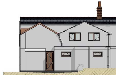
4 Rear Elevation 1:100