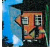
Sustrand 114 sq. ft. | 4 bedrooms