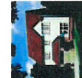
Shrewsbury 114 sq. ft. | 4 bedrooms