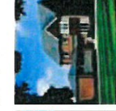
Conterbury 114 sq. ft. | 4 bedrooms