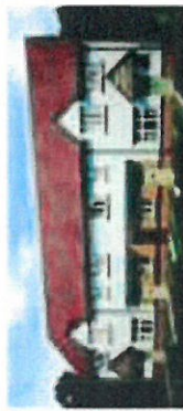
Hambleton 114 sq. ft. | 3 bedrooms