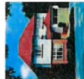
Windzor 114 sq. ft. | 4 bedrooms

The house type mix for the proposed development is shown above and illustrates the high quality housing Redrow believe is the 'best fit' for the scheme. The Arts and Craft styling of the facades in a modern context is timeless and extremely popular. This design styling creates houses that will sit well in the setting of this development alongside/opposite other house style in the local vernacular.