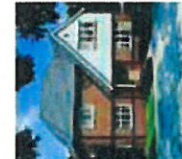
Shrewsbury 114 sq. ft. | 4 bedrooms