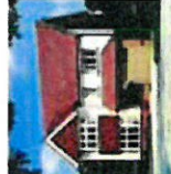
Oxford 114 sq. ft. | 4 bedrooms