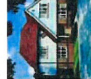
Shrewsbury 114 sq. ft. | 4 bedrooms