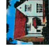
Cambridge 114 sq. ft. | 4 bedrooms