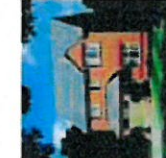
Shrewsbury 114 sq. ft. | 4 bedrooms