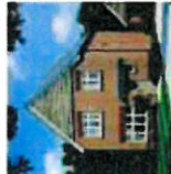
Warwick 103 sq. ft. | 3 bedrooms