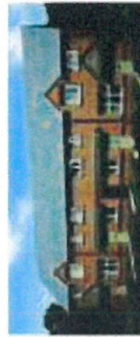
Hambleton 114 sq. ft. | 3 bedrooms