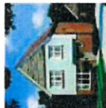
Warwick 103 sq. ft. | 3 bedrooms