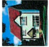
Sustrand 114 sq. ft. | 4 bedrooms