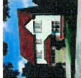
Shrewsbury 114 sq. ft. | 4 bedrooms