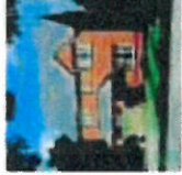
Shrewsbury 114 sq. ft. | 4 bedrooms