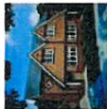
Letchworth 95 sq. ft. | 3 bedrooms