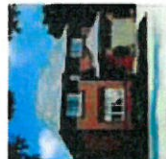
Windzor 114 sq. ft. | 4 bedrooms