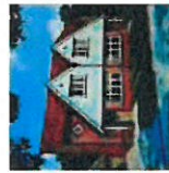
Letchworth 95 sq. ft. | 3 bedrooms