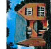
Cambridge 114 sq. ft. | 4 bedrooms