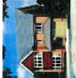
Oxford 114 sq. ft. | 4 bedrooms