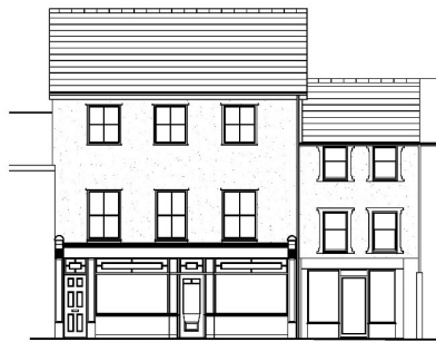
FRONT ELEVATION North West