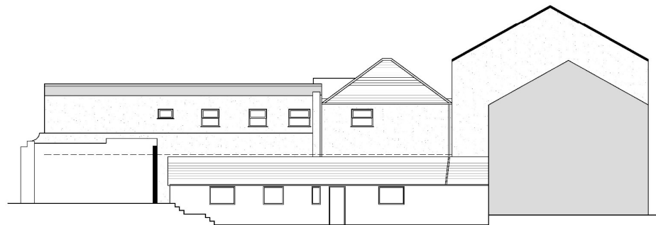
SIDE ELEVATION North East