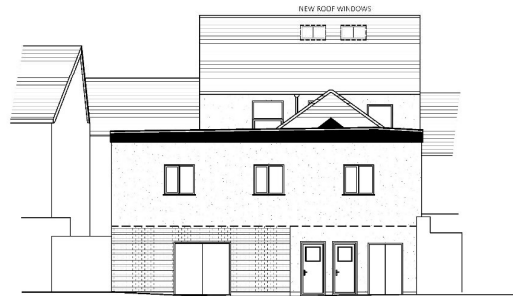
REAR ELEVATION South East