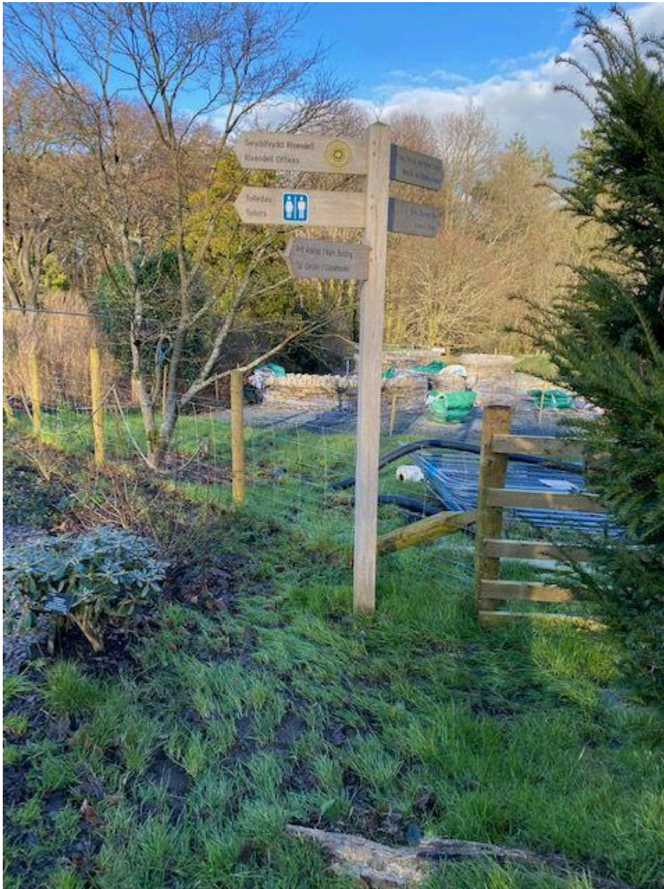
Photograph 4 (on TBG - not a public highway) Coastal path sign TBG signpost 2