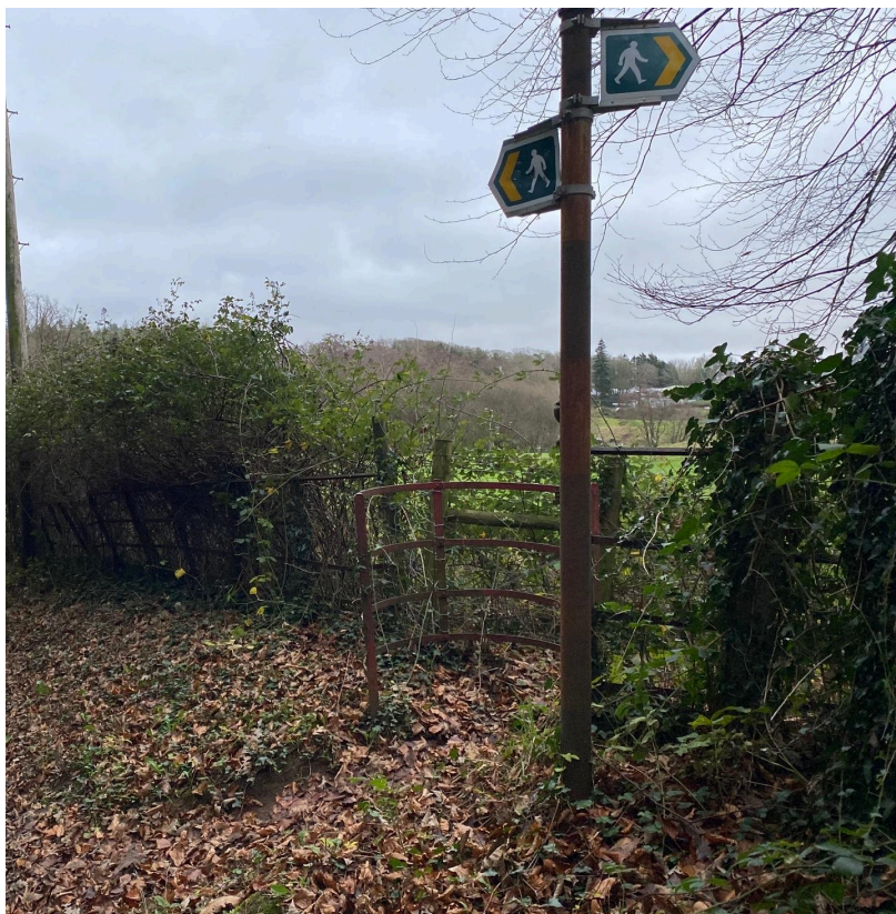
Photograph - 6 (Not on existing Public Footpath)

Red kissing gate and two footpath arrow signs. One directs the public over the field and the other to Treborth Road. Both arrow signs divert the public from the Hall / School. There is no arrow sign pointing towards the Hall.