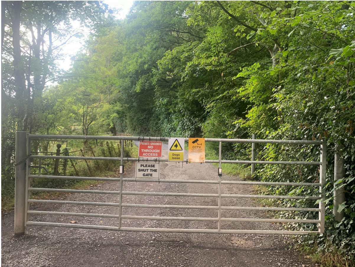
Photograph - 4(2) (Not on existing Public Footpath)

Treborth Road access gate 1 to front of Treborth Hall (left-hand gate) with the following signs: Private Grounds No-Through Access, Please Shut the Gate, CCTV in operation and Dogs Loose.