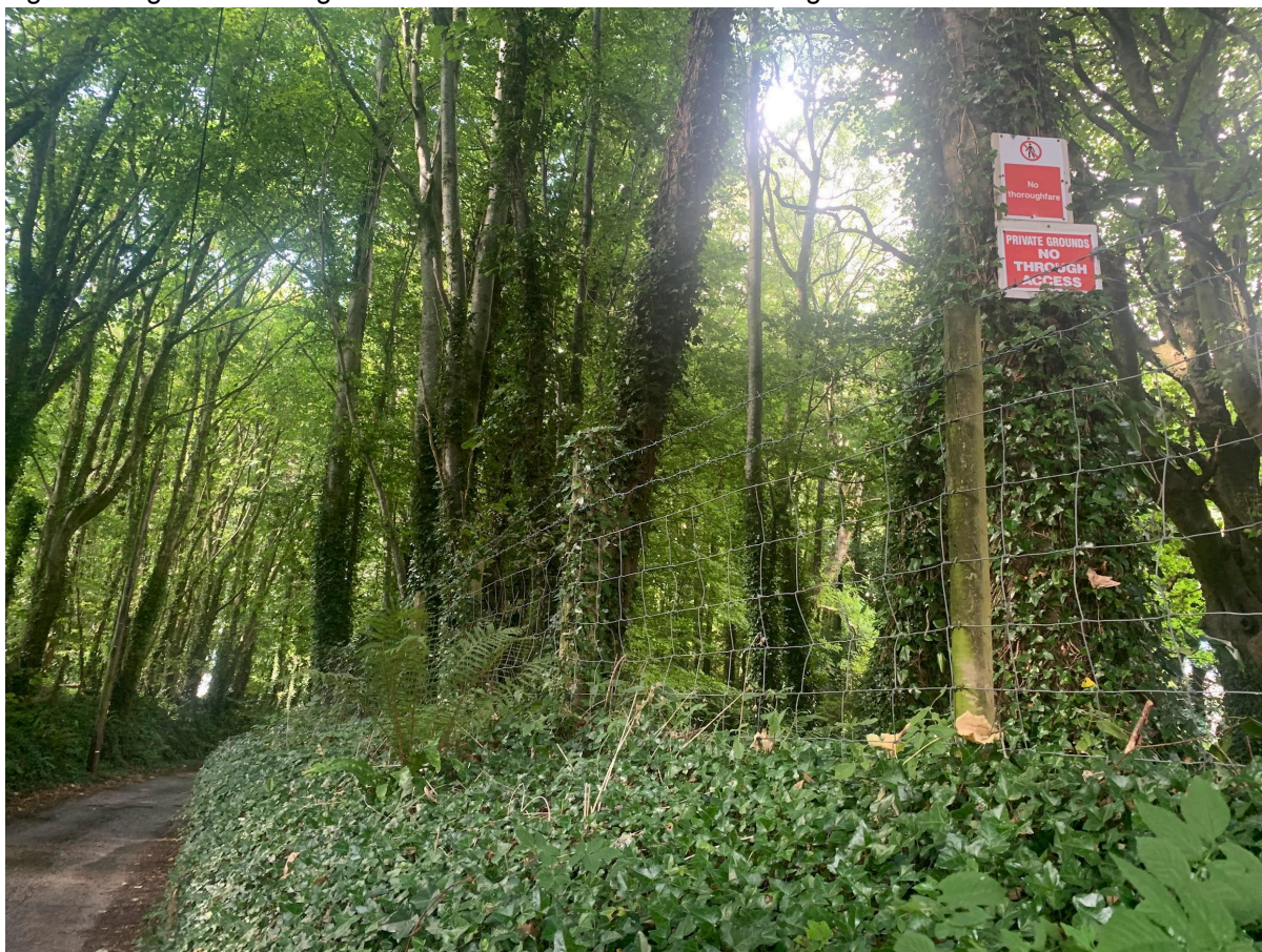
Photograph - 8 (Not on existing Public Footpath)

Signs stating: 'No Thoroughfare' and 'Private Grounds No Through Access'