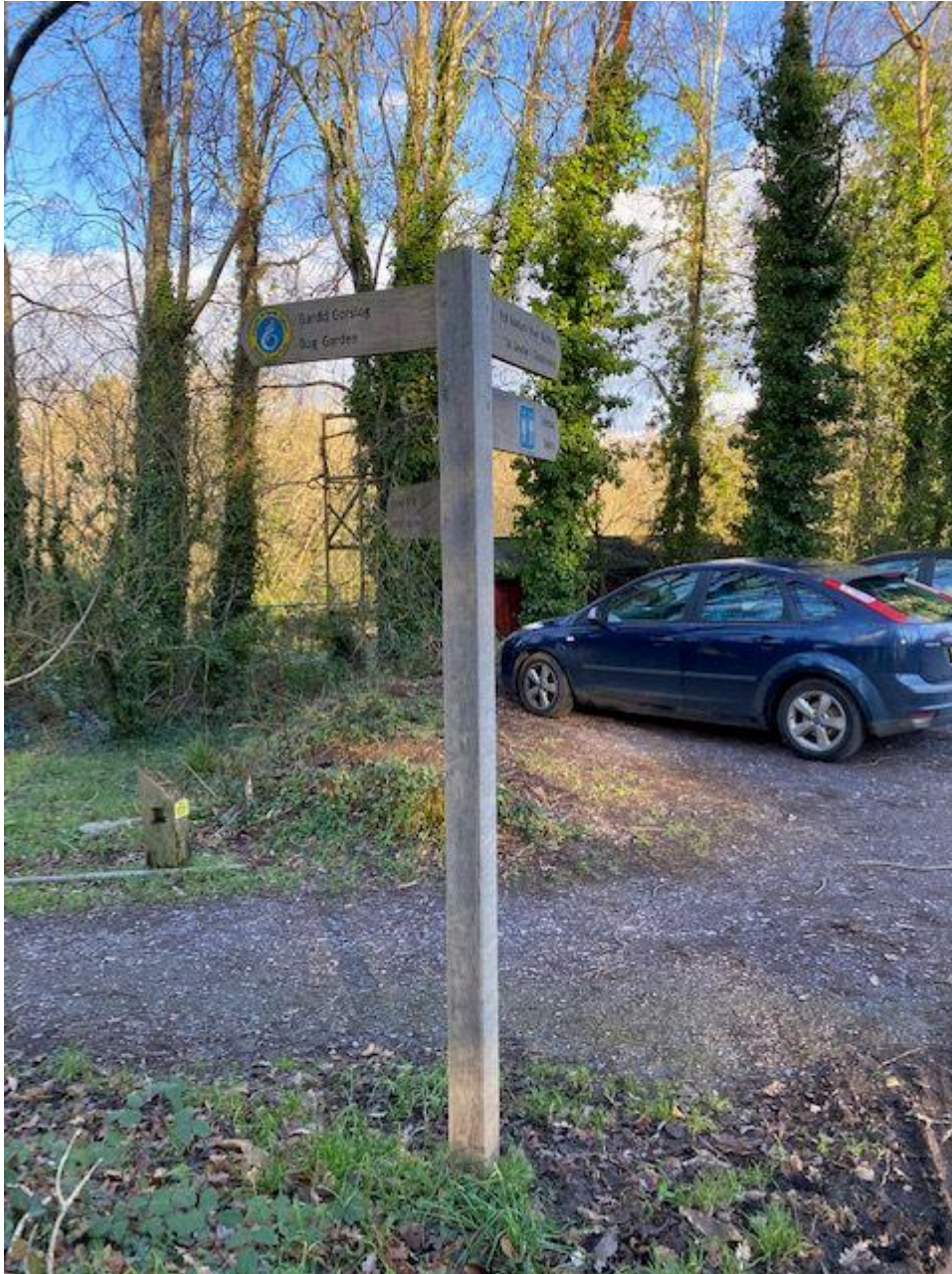
Photograph 5 (on TBG - not a public highway) Coastal path sign TBG signpost 3