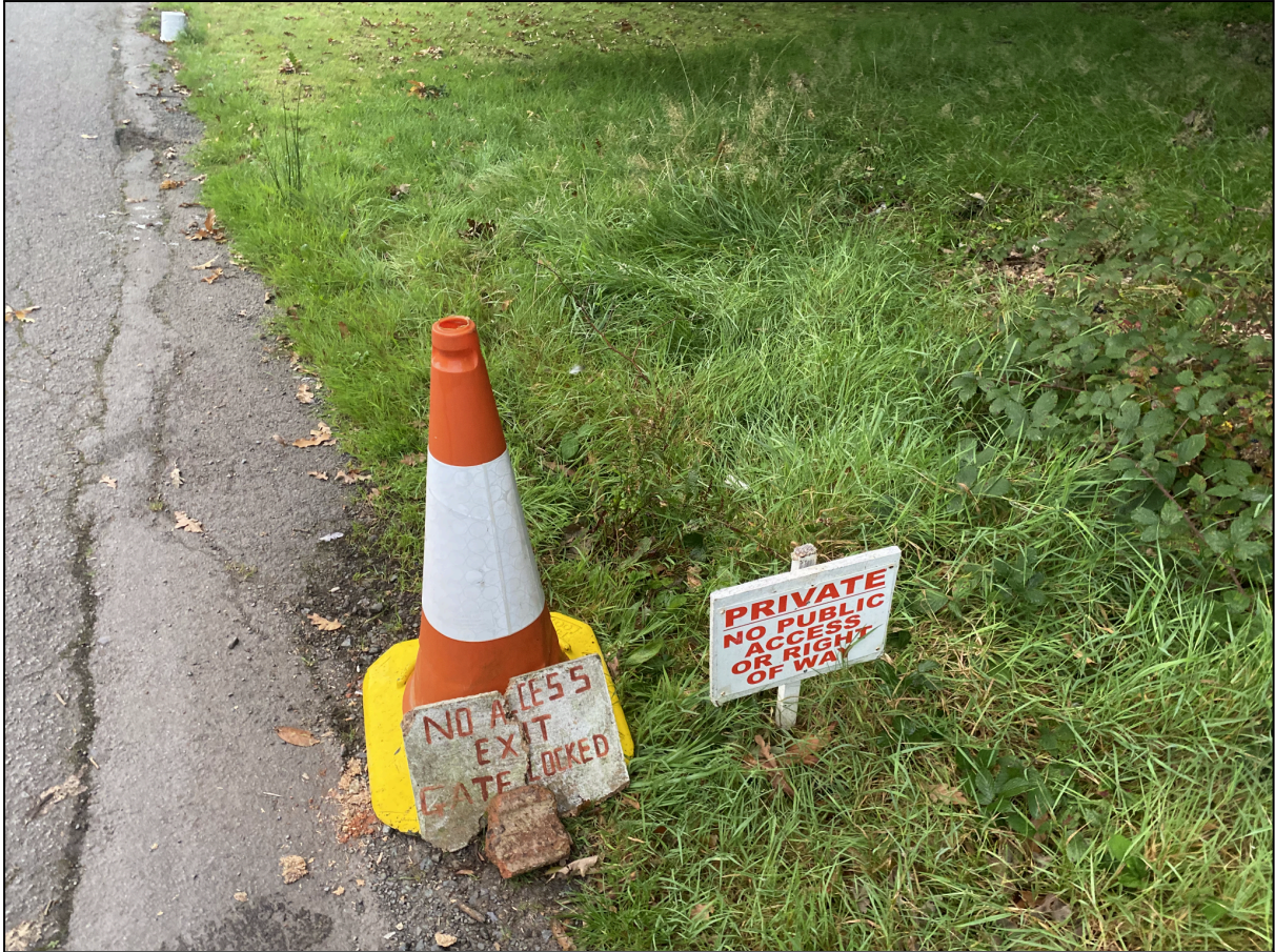
13.5 Since 2014, there has been signs placed on the grass island in front of Treborth Hall stating "Private - No Public Access Or Right Of Way"