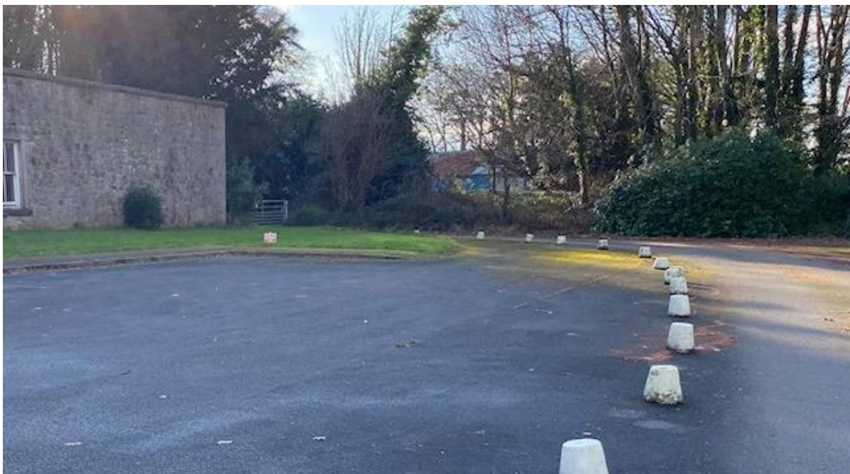
10.4 Picture taken of the side gate being closed and causing an interruption to the route

right of way. This was removed by the Council in 2019 and the owner of Treborth Hall then placed it on the gate next to the school. During 2019, the “PRIVATE” signs were