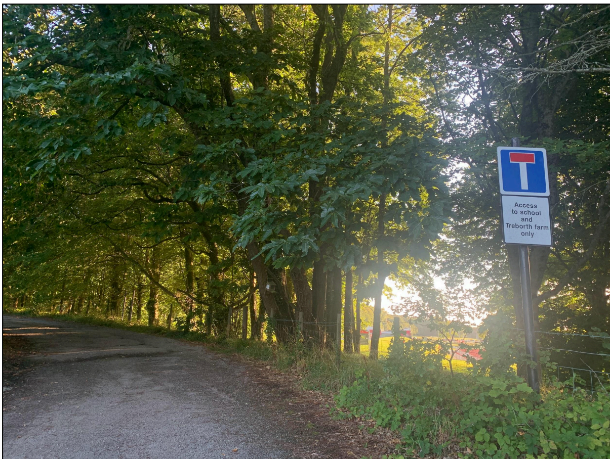
12.6 Signs from the Treborth Botanic garden stating "Access to School and Treborth Farm Only"