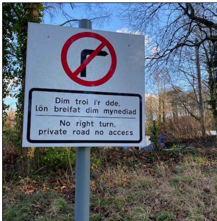
15.2 Recent image of the sign showing private road

Bangor University accepts that the road through Treborth Hall is private and that no members of the public should be using this route.