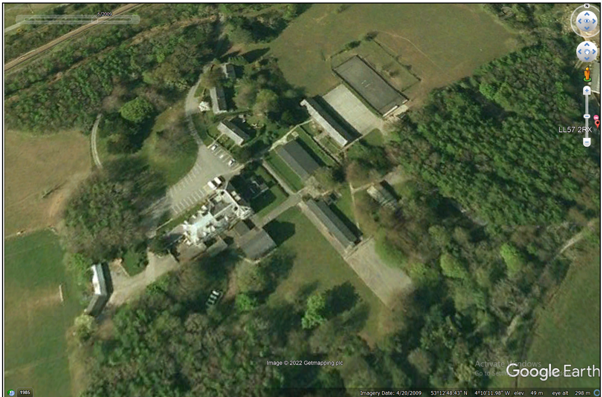
11.2 There were no white border stones to denote a route (2011)