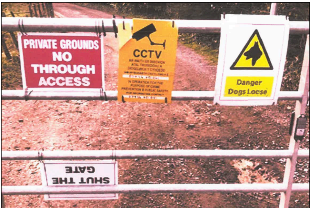
13.2 Another picture of signs that were placed on the main gate stating “Private grounds -