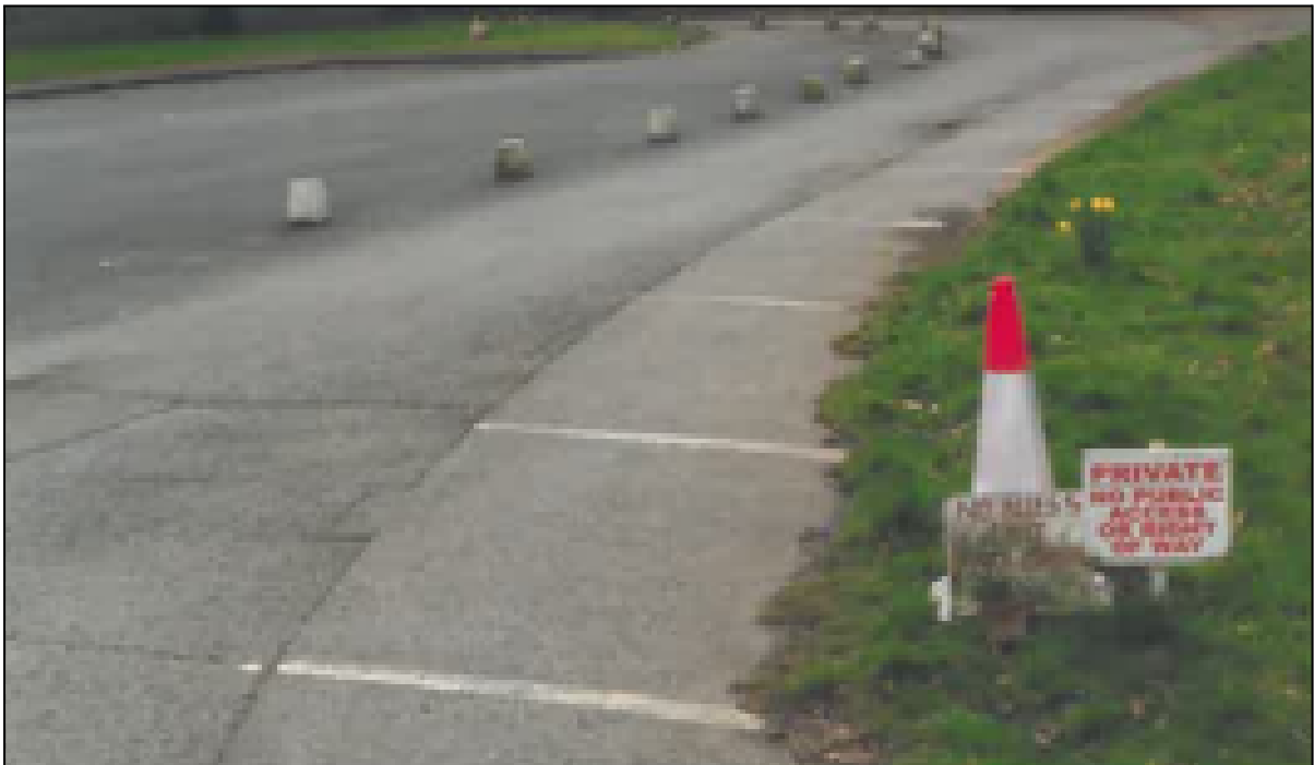
13.6 Signs placed on the grass island in front of Treborth Hall