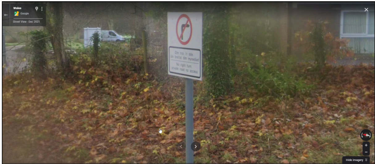
15.1 Google street view of sign installed by Bangor University showing the route as a "Private