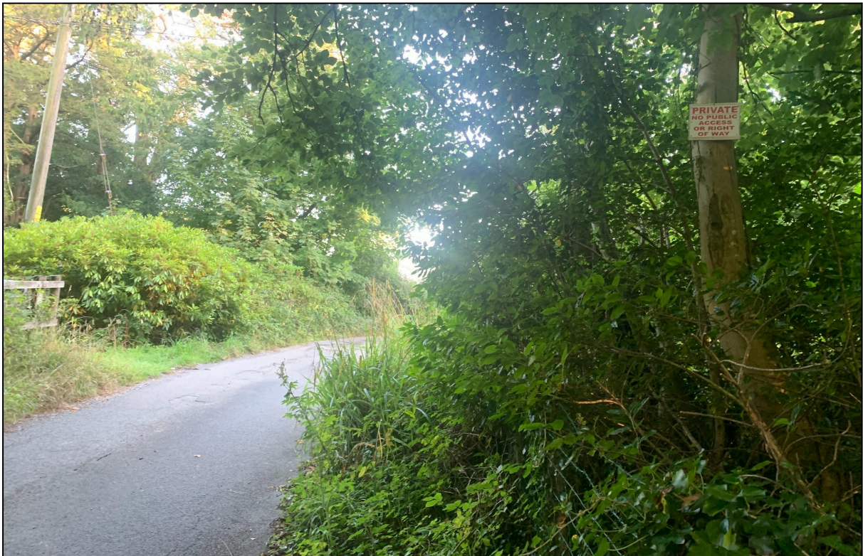
13.8 A Private - No Public Access or Right Of Way” sign was placed in the tree after the railway bridge