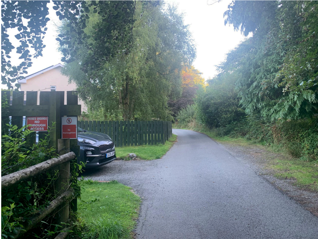
14.1 Signs were erected upon purchase of 5 Ty Ysgol Coed Menai in March 2021 saying “Private Grounds No through Access” and “No Thoroughfare”