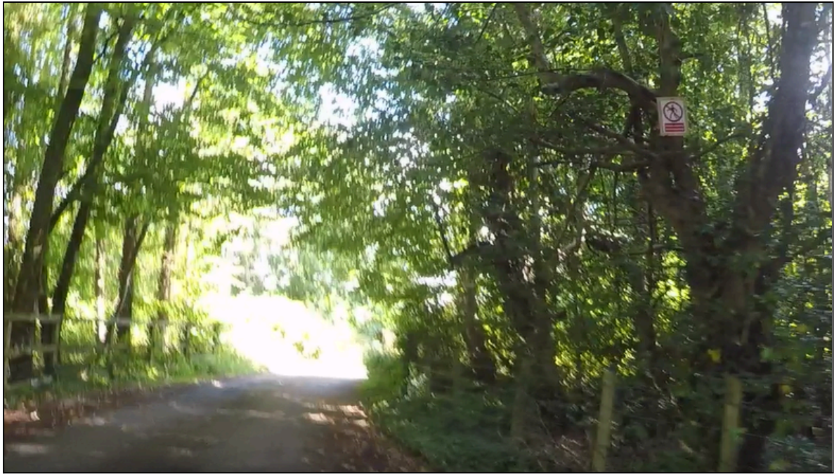
13.7 A “No thoroughfare” sign was placed on the trees after the railway bridge