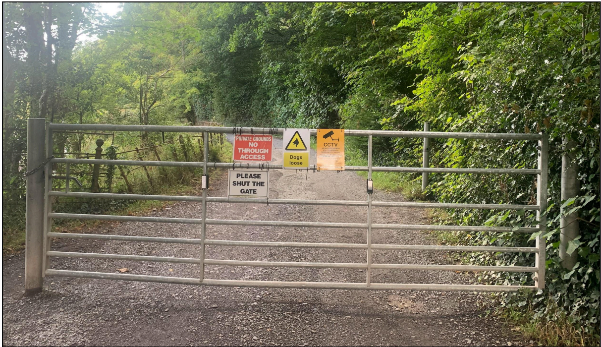
13.1 Signs were added to this gate from 2014 onwards that clearly say “Private Grounds - No Through Access”