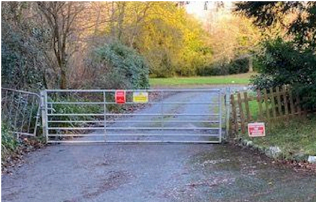
10.3 Another image of the side gate in situ with “No trespassing” signs. A Private Grounds sign is located next to the side of the gate