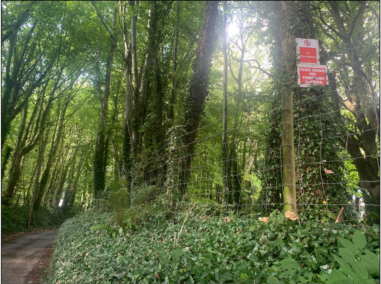
13.4 Just after the footpath on the right hand side are more signs. These read “No thoroughfare” and “Private Grounds - No Through Access”