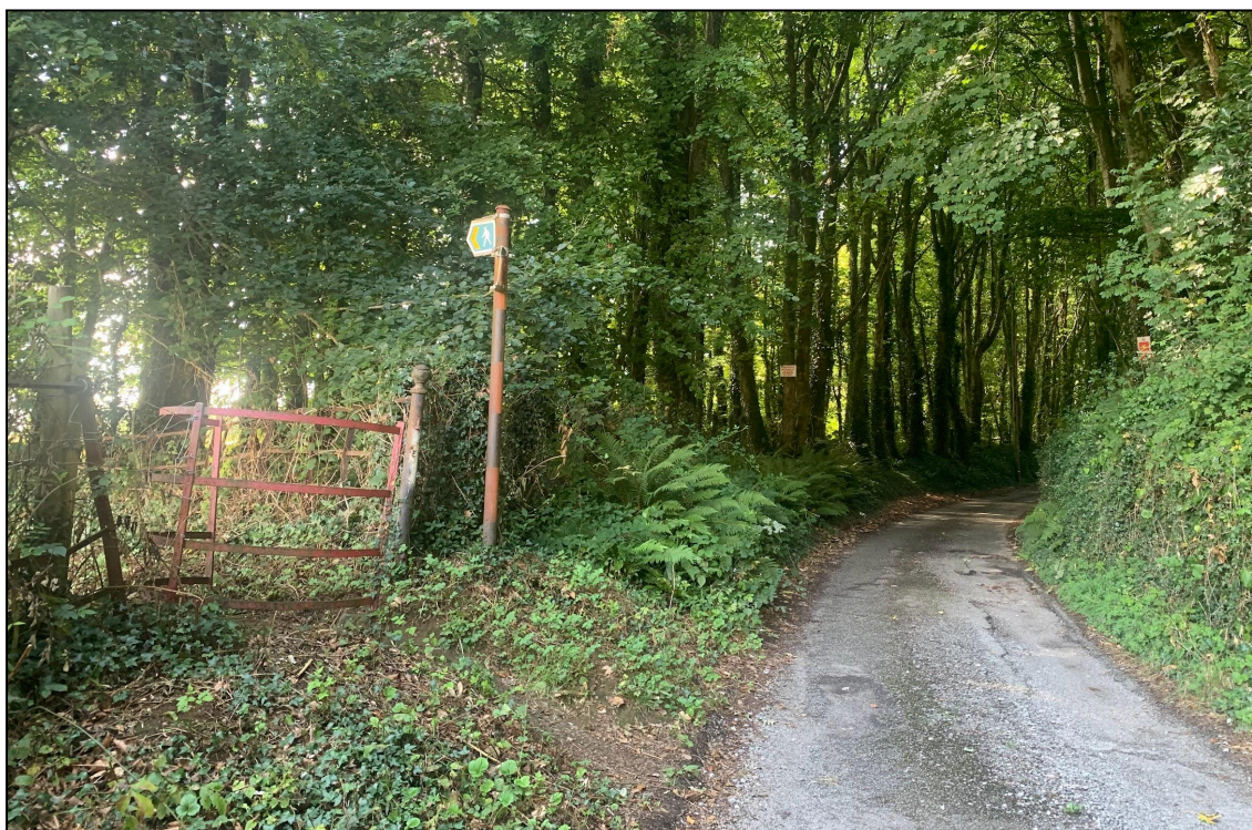
12.7 Public Footpath Sign Installed by Gwynedd Council in the 1970's (estimated)