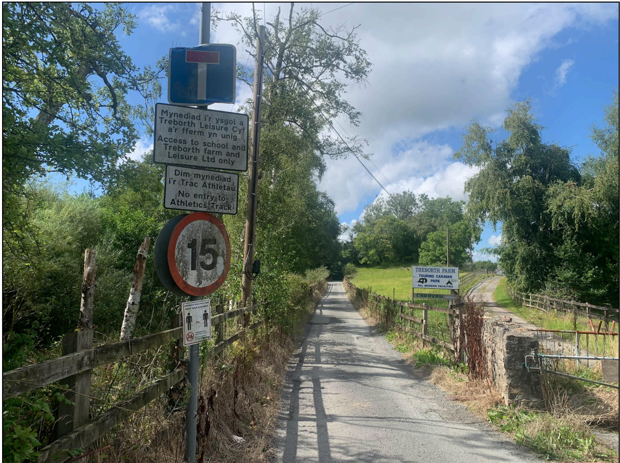
12.4 Access to School Only and No entry to Athletics Track