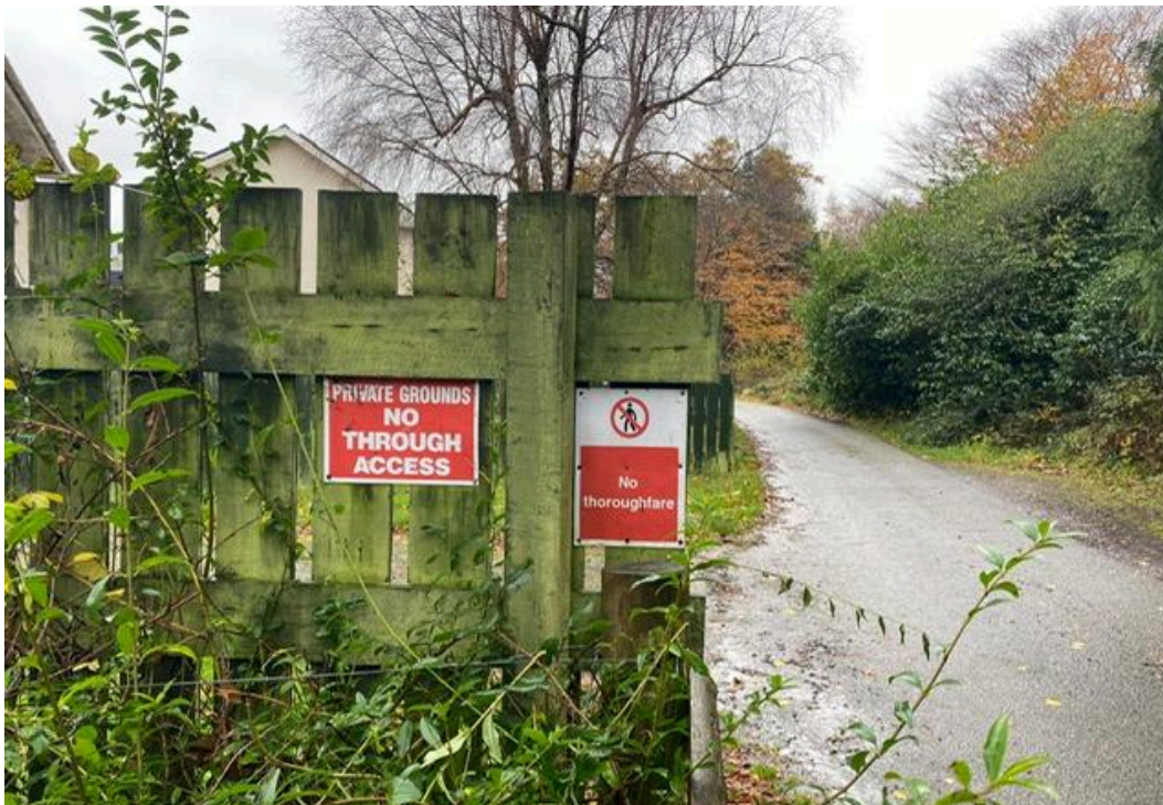
14.2 Signs have remained in place at 5 Ty Ysgol Coed Menai saying “Private Grounds No through Access” and “No Thoroughfare”