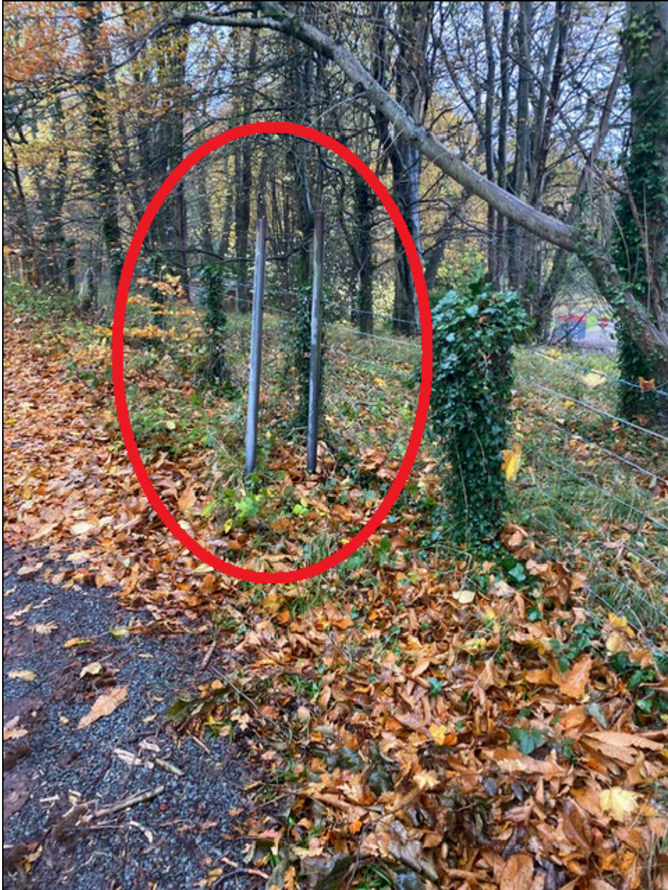
12.2 Signs posts remain where the main entrance to Ysgol Treborth would have been placed

In addition to the “Private” signs that were installed by the education authority in the 1950’s, there are multiple current signs that exist to this day which are in place to deter the public use of this route.