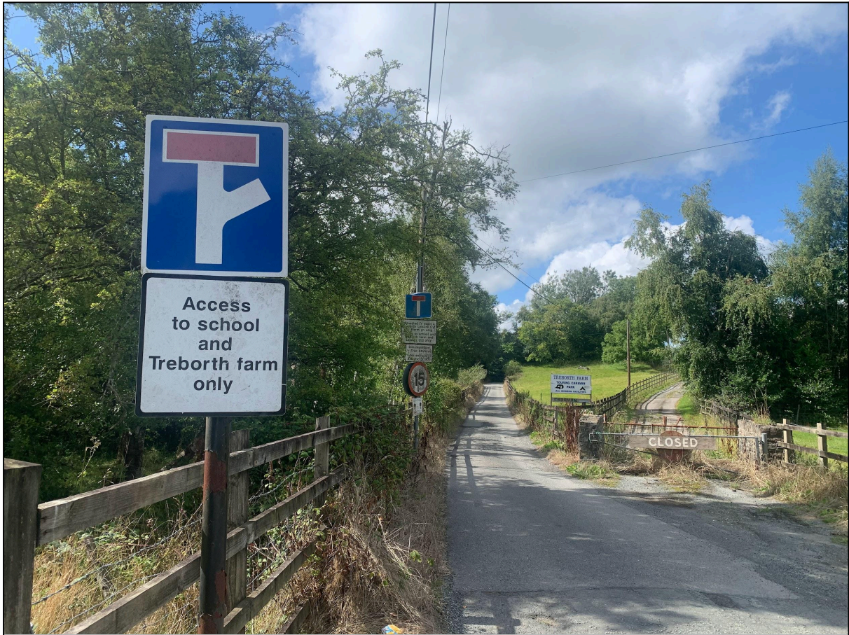
12.3 Access to School and Treborth farm only signs

should not be using this way as a through road to get to other places. This sign is a clear intention from the education authority that they did not want the route to be dedicated as a shortcut for any users of the route including pedestrians.