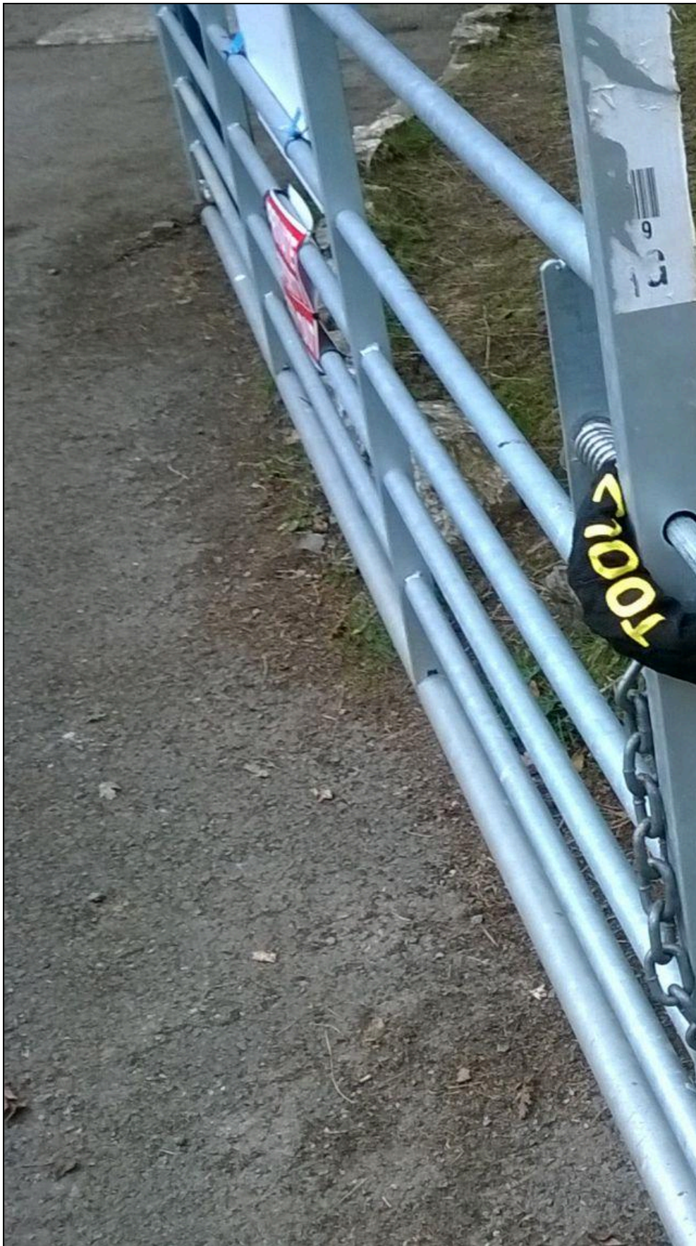
10.2 Side gate installed by Treborth Hall Owners with "Private Property Keep Out" signs in 2014