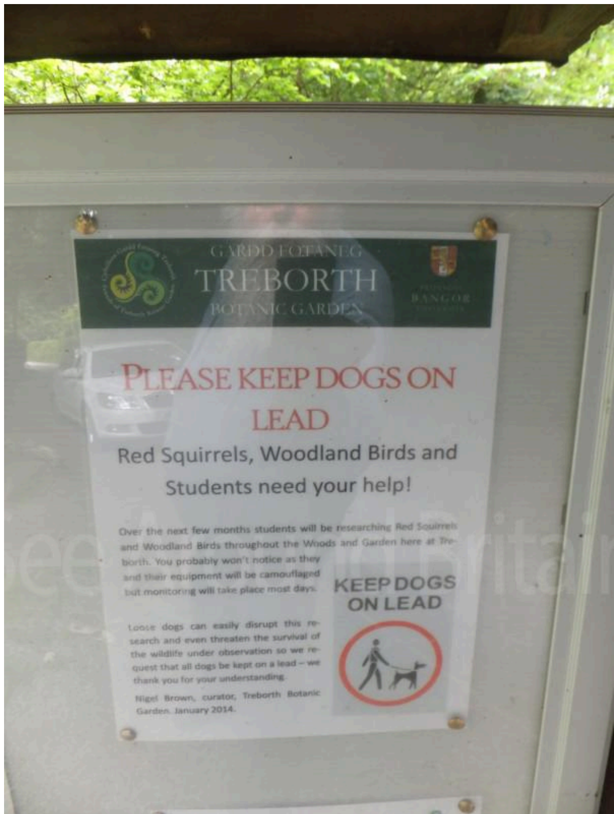
16.23 Permissive Use of gardens 2014