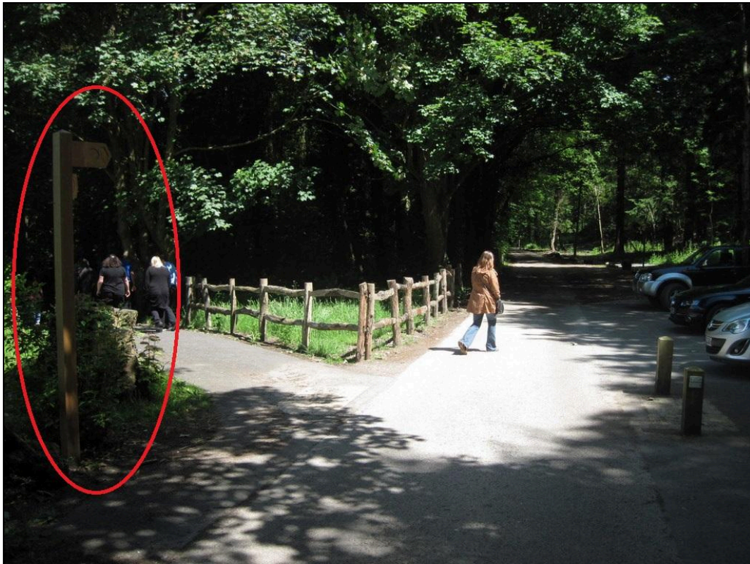
15.5. Sign Directing Walkers away from Botanic Garden Buildings from roughly 2011/12