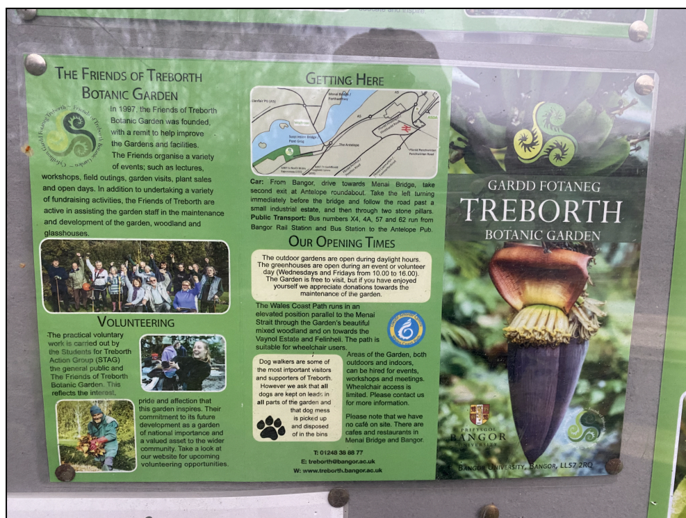
16.3 Brochure of Treborth Botanic garden showing the garden opening times - Open during daylight hours

The route has to be walkable during all hours. The Botanic garden has clearly always been advertised as being open to the public during daylight hours only . Members of the public using this route during night hours were trespassing on University grounds.