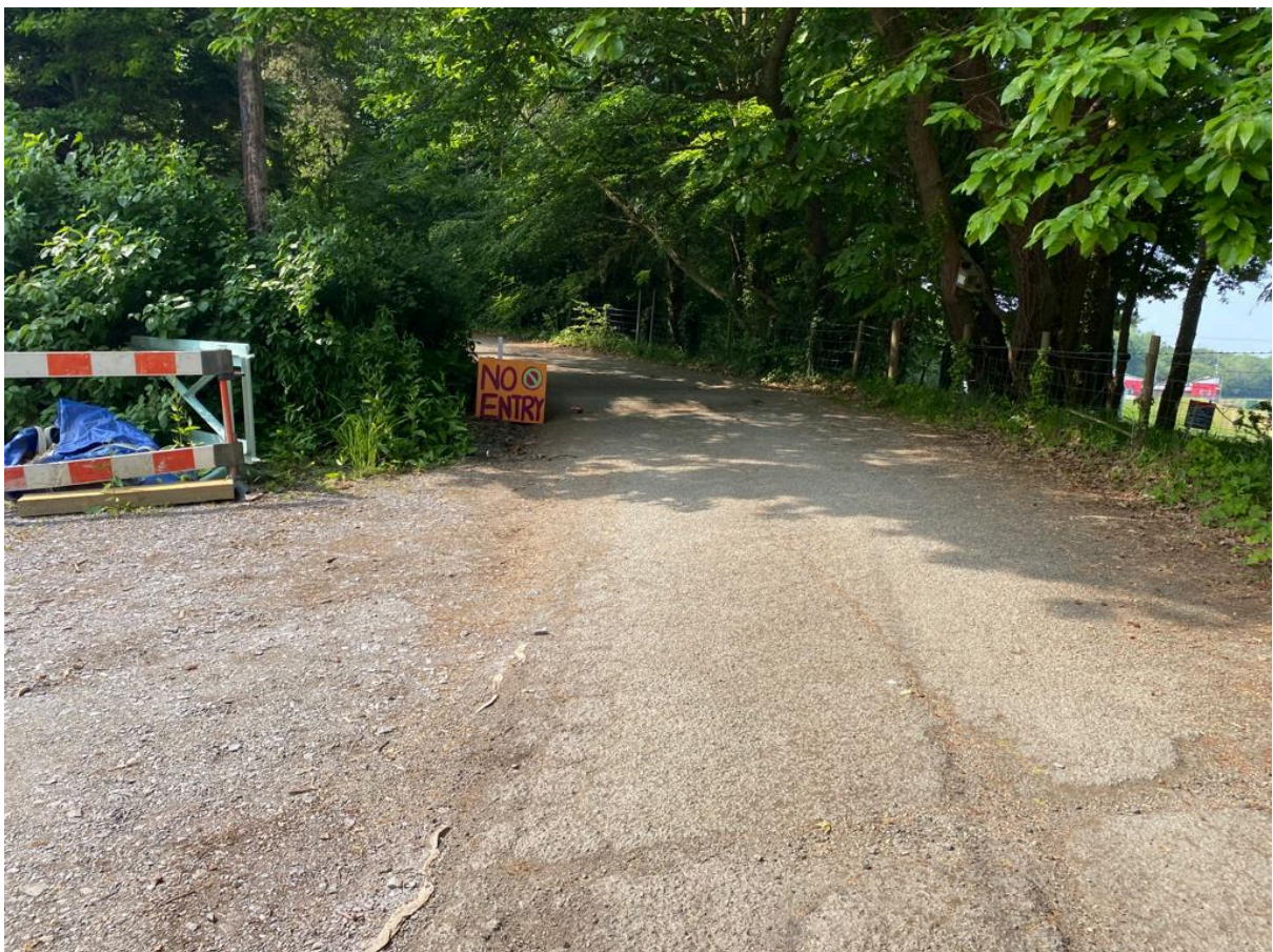
15.12 Example of No Entry signs placed during garden events