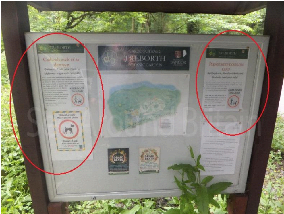
16.21 Permissive Use of gardens 2014