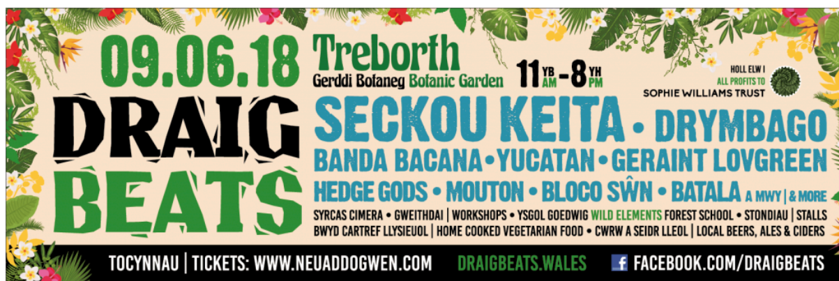
16.18 Example of Draig Beat Events 2019 - Restricted Garden Access