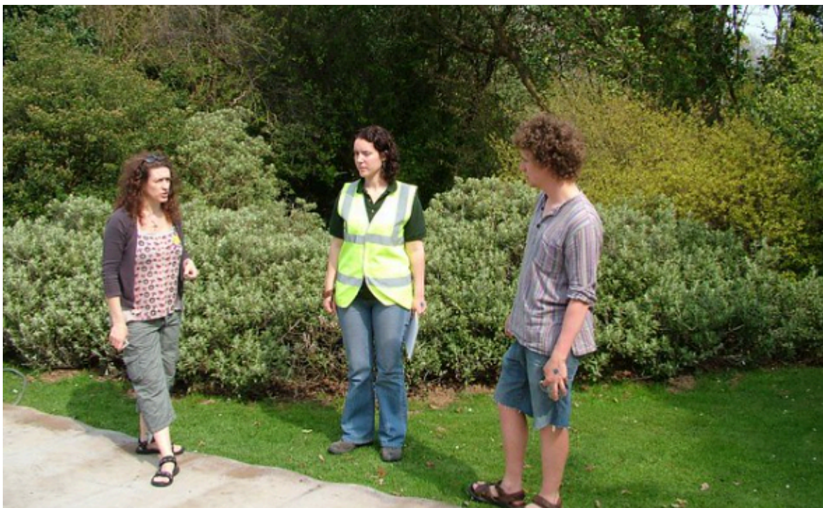
16.14 Botanical Beats 2007 - Stewards at the garden entrance showing restricted public Access