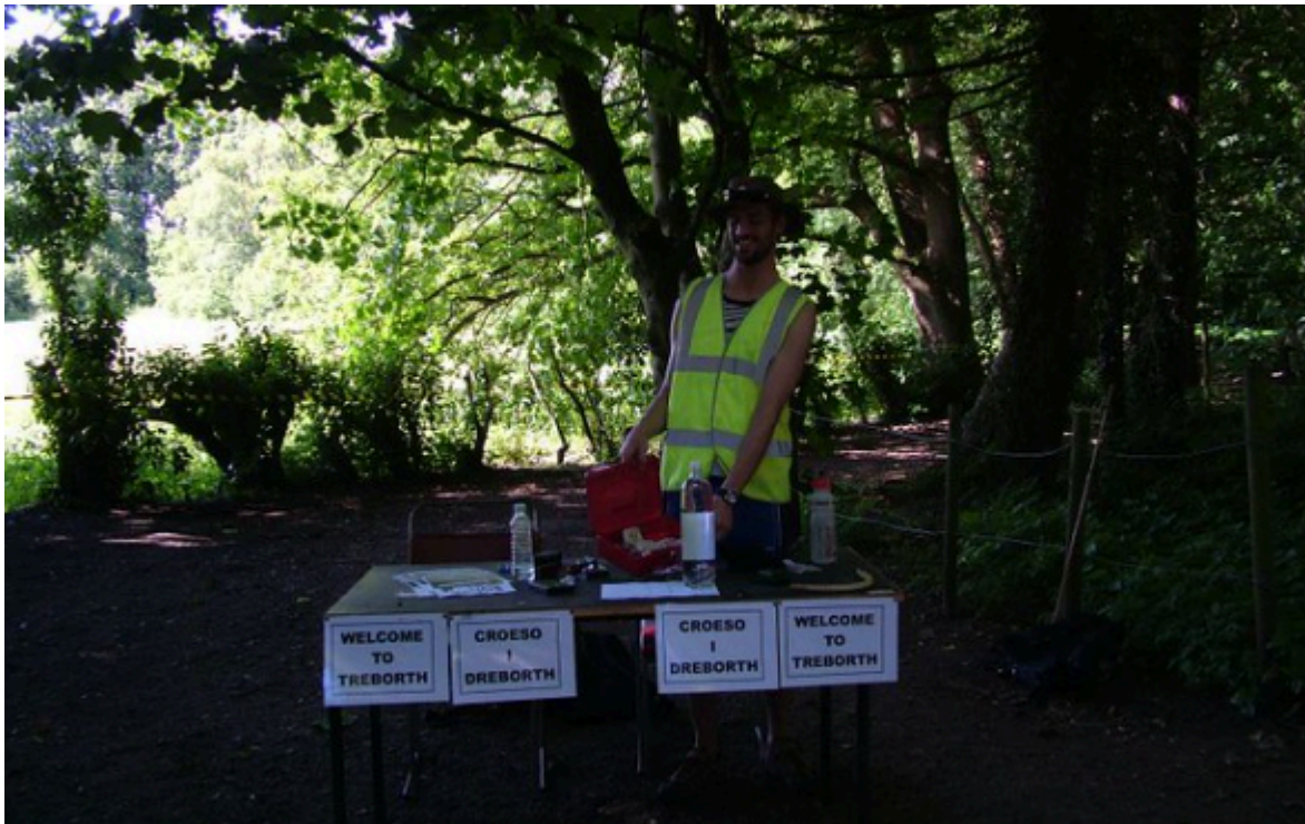
16.15 Botanical Beats 2008 - Restricted Access