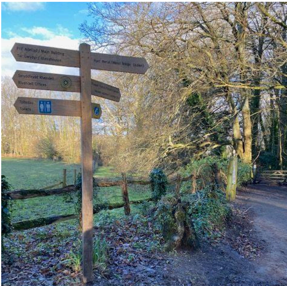
15.8 New Signs installed by Bangor University along the proposed route (2023)