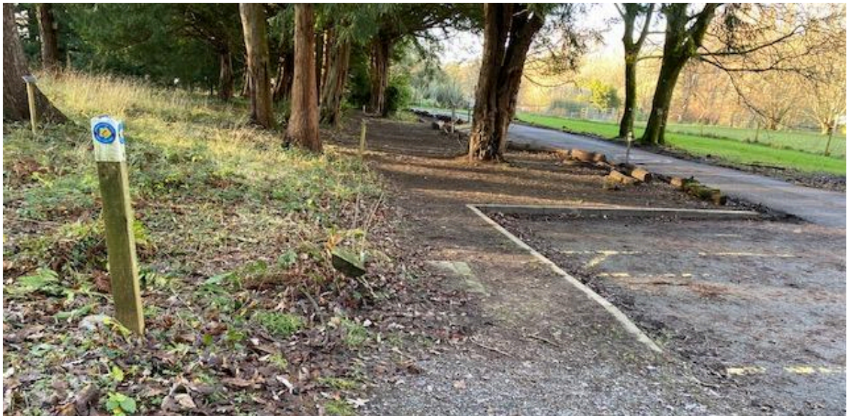
15.7 Wales Coastal Path sign directing walkers which route they should be taking