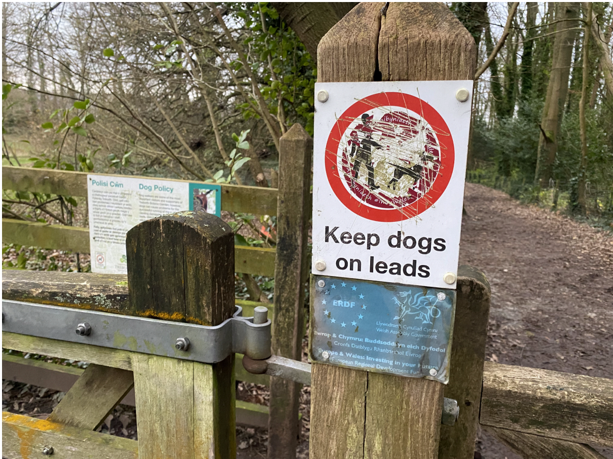
16.24 Dog signs added to the new Wales Coastal Path have been vandalised