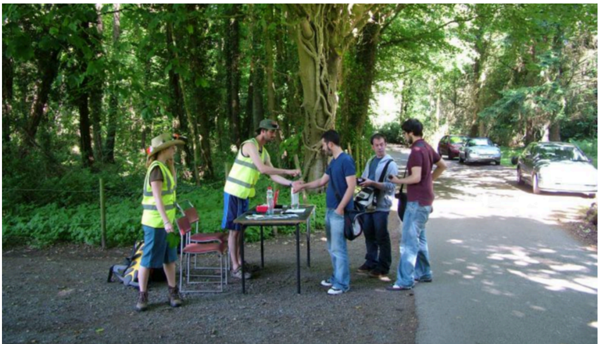
16.16 Botanical Beats 2008 - Restricted Access