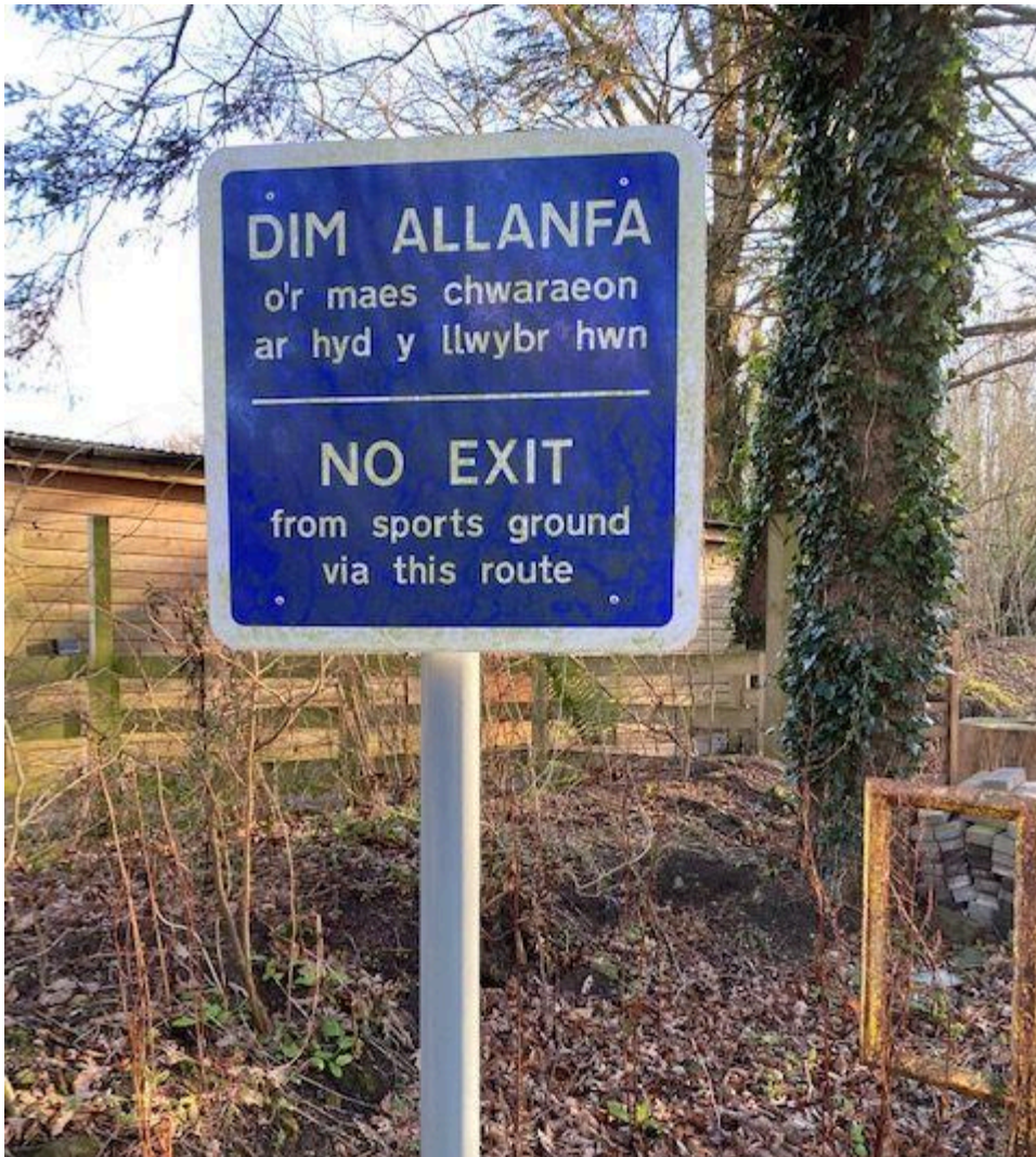
15.3 No Exit sign installed by bangor University