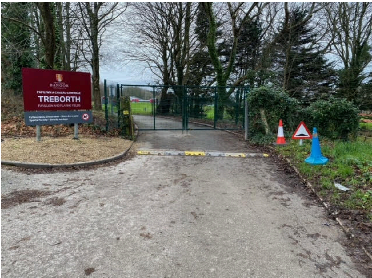
16.22 New signs and security fencing and gates have been installed by Bangor University. Permissive rules still apply