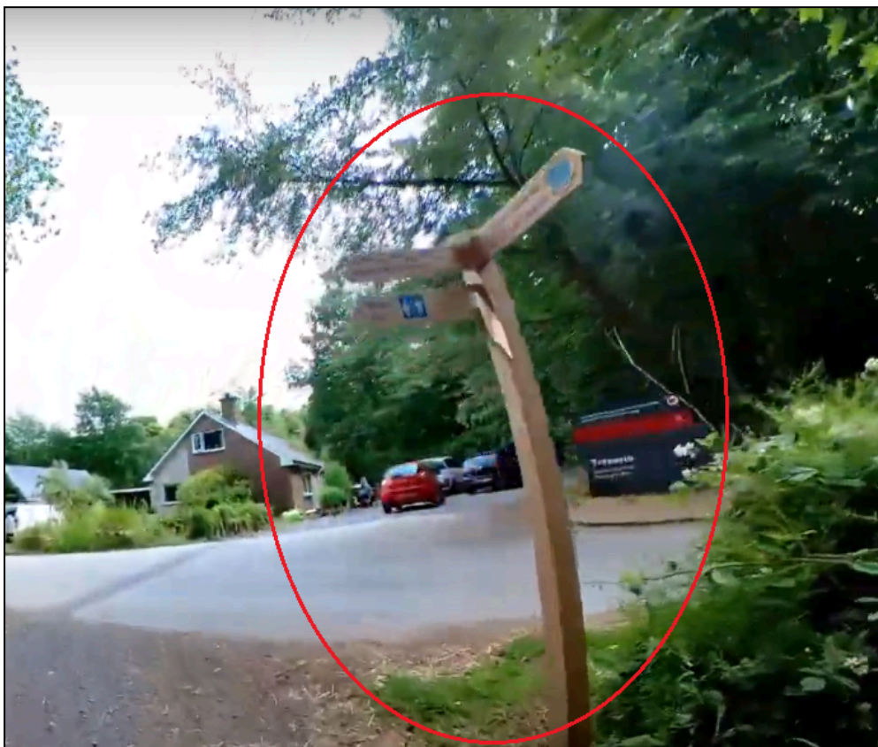
15.6 No signs showing that walkers should be heading in the direction of Treborth Hall