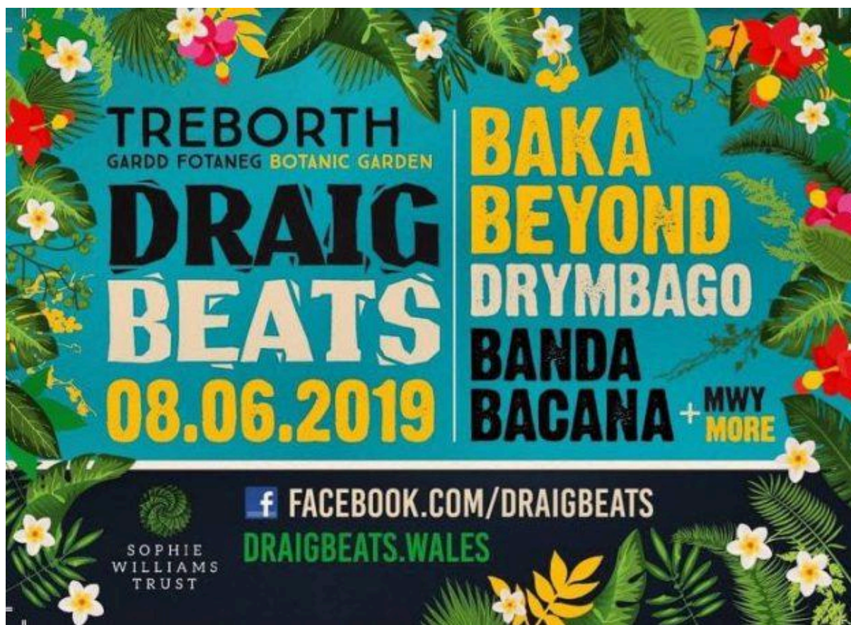
16.17 Example of Draig Beat Events 2019 - Restricted Garden Access