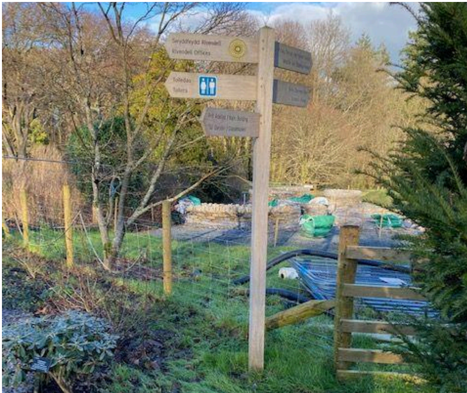
15.9 New Signs installed by Bangor University along the proposed route (2023)