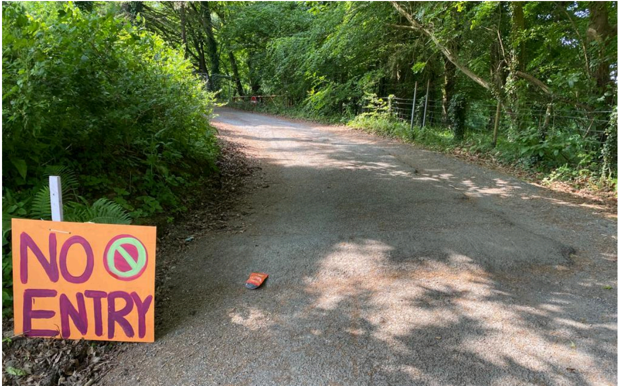
15.11 Example of No Entry signs placed during garden events