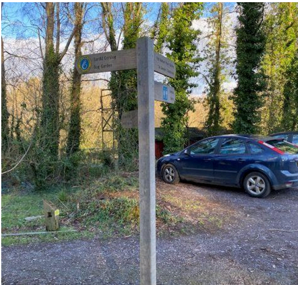
15.10 New Signs installed by Bangor University along the proposed route (2023)