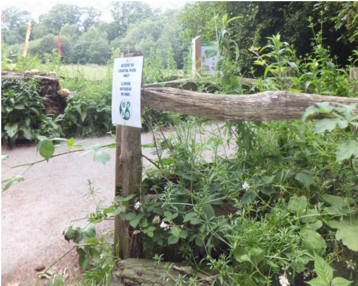
15.4 Picture taken from 2012 showing an “Access to coastal path only” sign along the proposed route