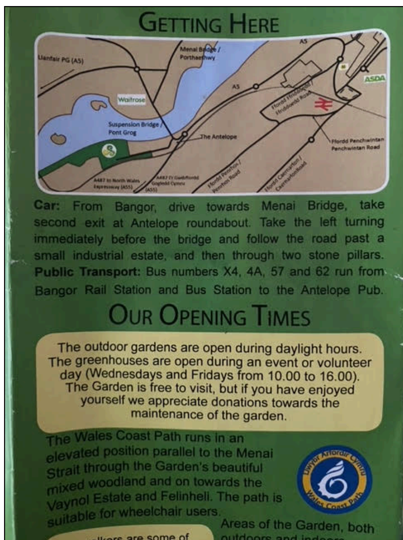
16.4 Close up of the brochure showing Treborth Botanic Garden opening times

Nigel Brown who was the curator for a very long time has not got involved in the DMMO application.