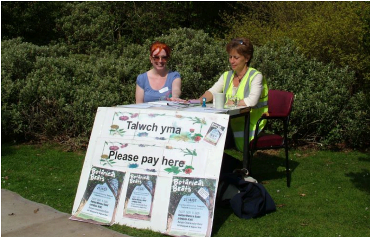
16.13 Botanical Beats 2007 - Stewards the garden entrance showing restricted public Access